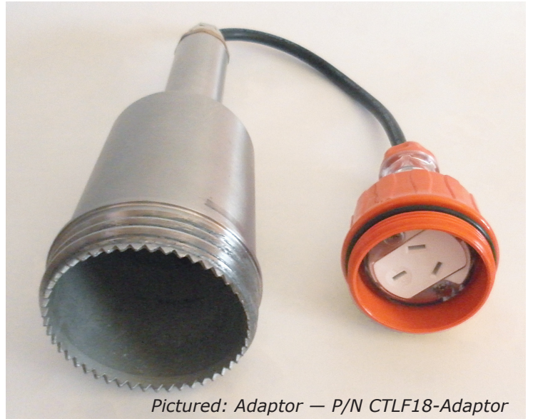
Pictured: Adaptor — P/N CTF18-Adaptor

Simply select a luminaire on the circuit you wish to test, remove the fitting and plug in the adaptor to perform protection device testing. Once testing is completed, unplug the adaptor and refit the luminaire.