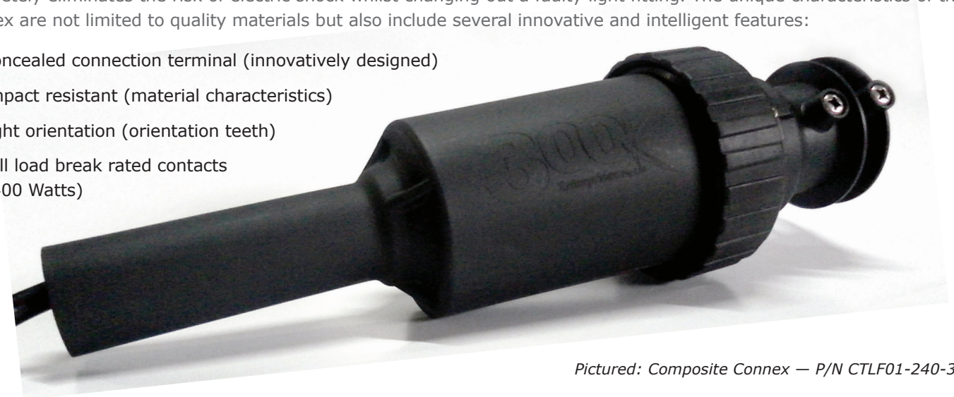
Pictured: Composite Connex — P/N CTF01-240-34